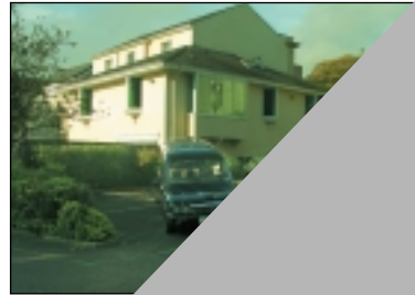
'Newport Funeral Home'

Newport Funeral Home 9-11 Cardiff Road Newport NP20 2EH Telephone: (01633) 266848 (24 hrs) Facsimile: (01633) 266969 Email: info@toveybros.co.uk Website: www.toveybros.co.uk